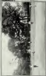
Girls Tennis Tournament